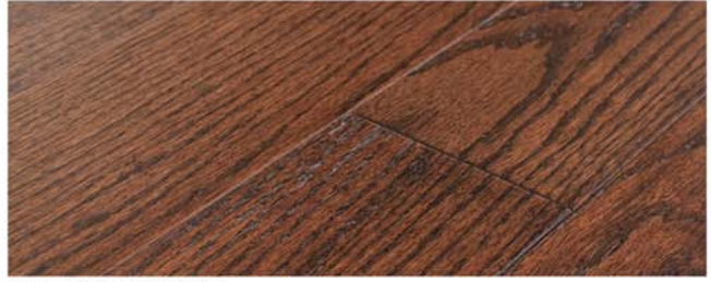
N.A. RED OAK GRANGER