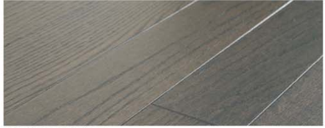
N.A. RED OAK KALISPELL