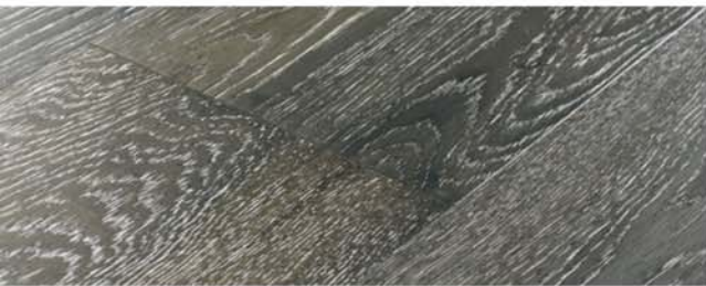
OAK GRANITE PASS