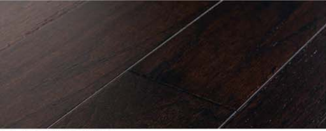
N.A. RED OAK COLCHESTER